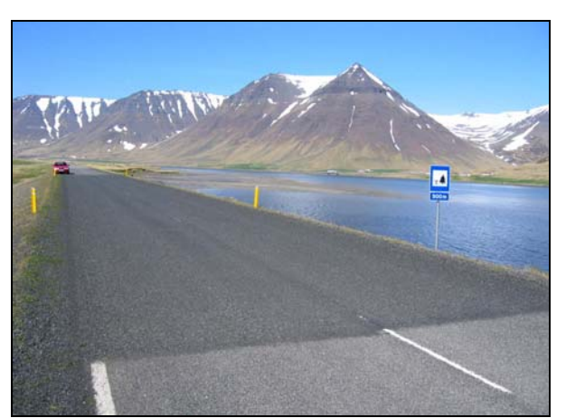
Figure3 Overview at Vadall section