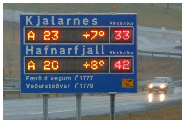
Figure 1. Backlit billboard for two nearby locations. Wind gusts are shown in red for measurements at least 15 m/s.

Strong wind gusts close to steep mountains are a threat to the safety of travellers on the Icelandic National Roads. Numerous events of strong wind gusts blowing vehicles off roads, and the collateral damage is considerable. Injuries have occurred in these events, as well as fatalities. The maximum wind gusts can easily exceed 50 m/s during these events. The Icelandic Road Administration has operated roadside anemometers in a few of these places for 10 til 15 years. Measured wind gusts (1 sec) along with average winds velocity are displayed on backlit billboards at some distance before travellers reach these locations. A map of 60 known places where vehicles have been blown off roads has been produced. Data series from the weather stations have been analysed and the occurrences of wind gusts ( fg > 30 m/s) have been correlated with wind direction, wind velocity and temperature gradient at the 925 hPa and 850 hPa pressure levels via ECMWF ERA -Interim [1]. Based on this analysis a statistical model for the likelihood of wind gusts in 9 different locations in 1 hour time steps has been produced. Section 2 shows a wind gust map of Iceland, but in Section 3 the meteorological reasons for wind gusts in Iceland as well as the methods used to forecast the magnitude of wind gusts are discussed.