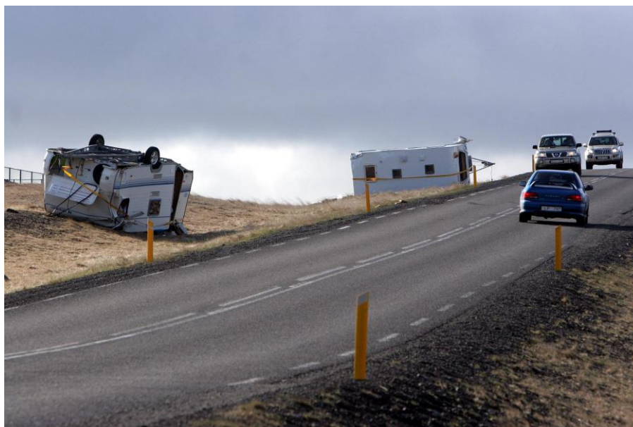
Figure 2. An example of collateral damage due to a violent wind gust in month of May.