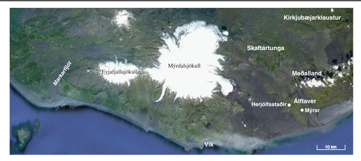
Fig. 2 Satellite image of Eyjafjallajökull and Mýrdalsjökull showing the location of the farmhouses Herjólfsstaðir and Mýrar in Álftaver, and Meðalland, Kirkjubæjarklaustur and Vík. Clouds can be seen around Meðalland

isolated location in the middle of the eastern jökulhlaup hazard zone.