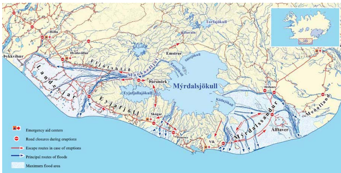
Figure 1. The volcanogenic hazard zone surrounding Mýrdalsjökull with the three main catchment regions Kötlujökull, Sólheimajökull and Entujökull ( www.almannavarnir.is ).

There are major concerns for tourists that frequent the Þórsmörk each year due their close proximity to Katla. During 2006 more than 20,000 overnight stays were recorded by tourists in this region. The majority of tourists visit Þórsmörk during the summer months